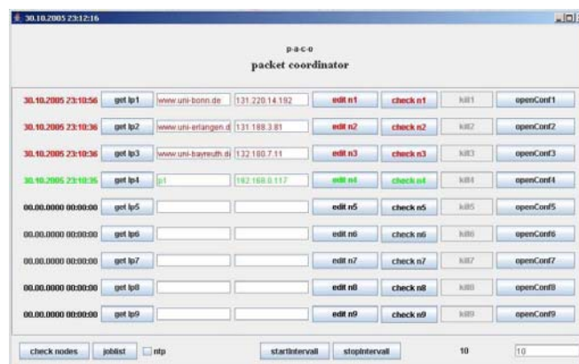
Figure 3. Screenshot of paco's main screen

Future extensions will include the management of packet receivers, the collection of measurement results, and a secured connection between the management unit and the Probes.